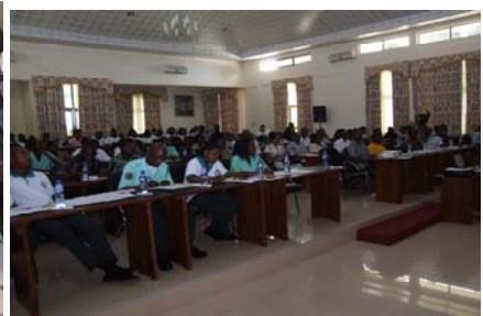
At the Motec Paramedic Workshop, Koforidua.