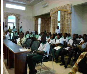
The back benches also attentive.