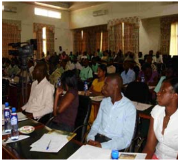
Some participants of the workshop listening attentively to a lecture.