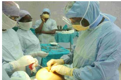
Knee surgery with local surgeon