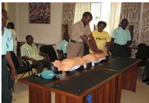
CPR Hands on for participants