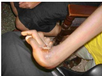
Wrist contracture before surgery