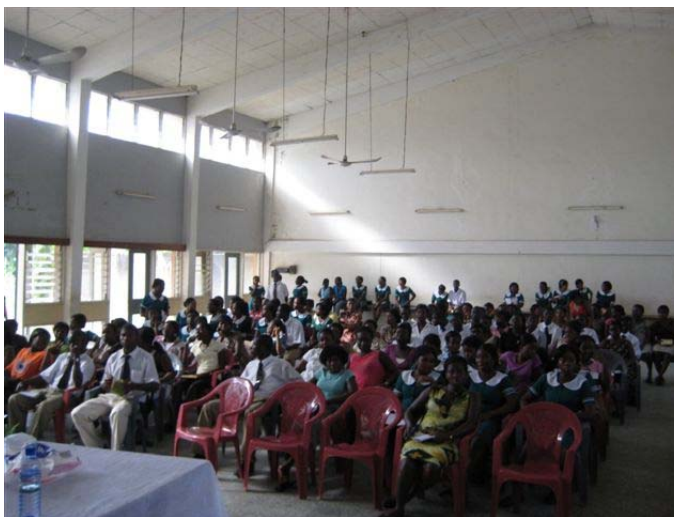
Motec lecture on Critical Care at Komfo Anokye Teaching Hospital