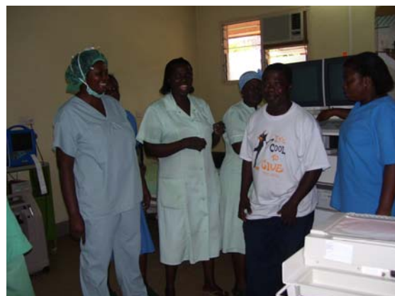
Donated Image Intensifier Nkawkaw Theatre Staff pose in front machine