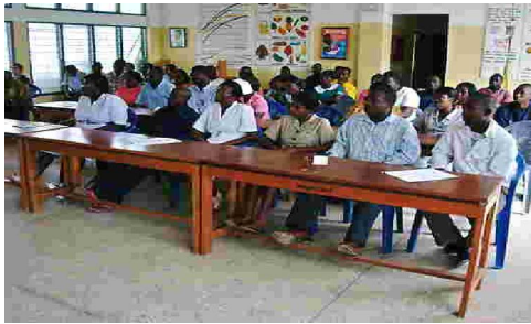
Lecture time at Pramso