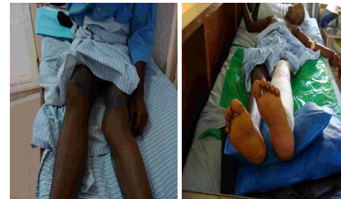
Painful leg deformity before and after surgery