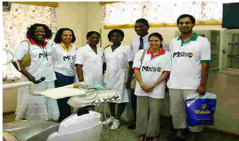
MOTEC - with Akosombo dental team.