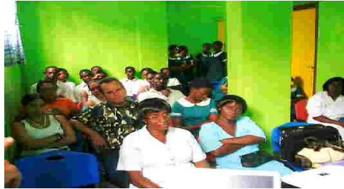
Sefwi Asafo Staff at pre-op lecture