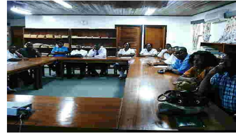
Educational Conference at Akosombo