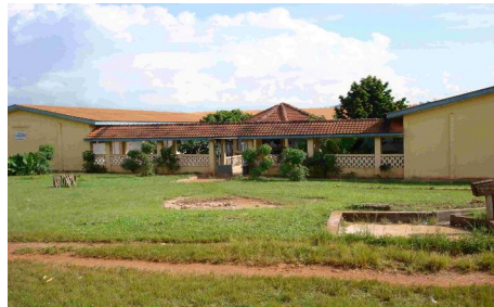
The proposed surgical centre beckons