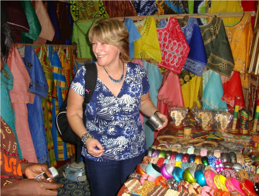
At the Cultural Centre in Accra