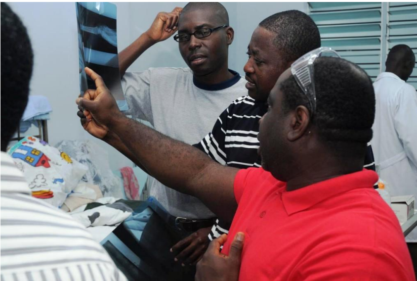
Teaching Ward round